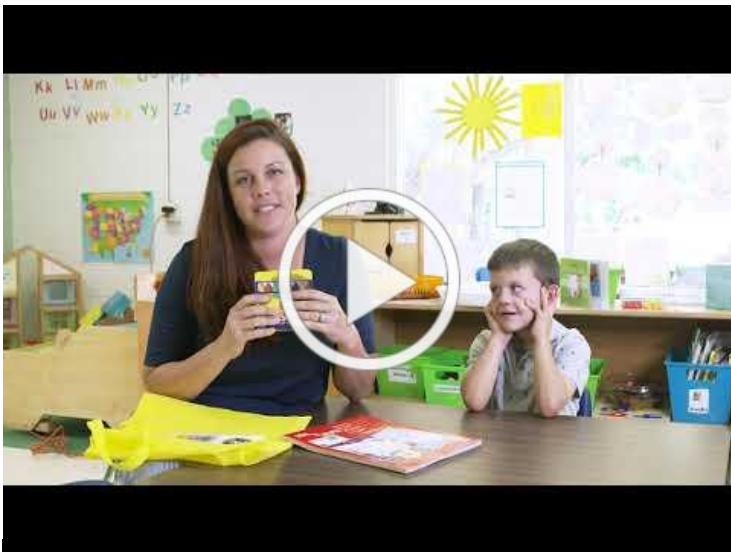
Using your Kindergarten Readiness Bag from the Suncoast Campaign for Grade-Level Reading Part II

For the 4th year, due to popular demand from teachers, principals, and willing funding partners, including The Patterson Foundation, Rotary Club of Sarasota Foundation, Charlotte Community Foundation, the