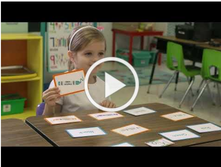
Using your Kindergarten Readiness Bag from the Suncoast Campaign for Grade-Level Reading Part I