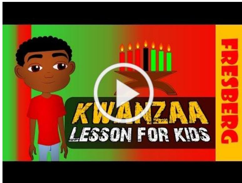
What is Kwanzaa? Check out this Kwanzaa for Kids Cartoon! Happy Kwanzaa