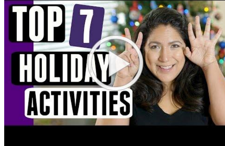
TOP Holiday Activities - Cheap and Easy