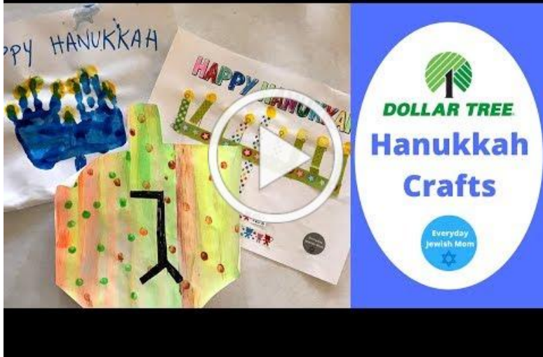
Hanukkah Crafts / Preschool Projects